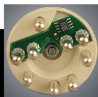
SmartChip™ Plug-In DuraTherm Heating Element