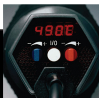
3 Stage Air Control